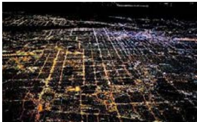
Figure 5 - Los Angeles, aerial image, a sort of city's Nightfly (Fagen, 1982)