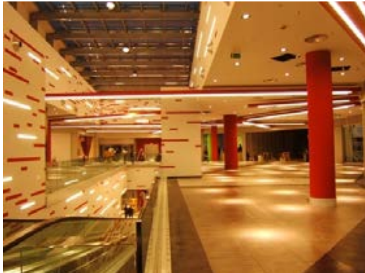
Figure 8 – Shopping Center, “any interior” by the catalog of a firm producing them