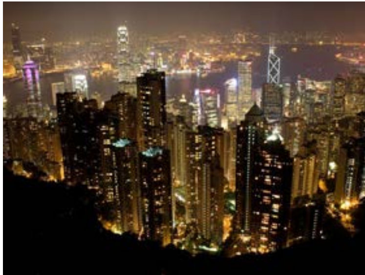
Figure 6 – Hong Kong, urban landscape