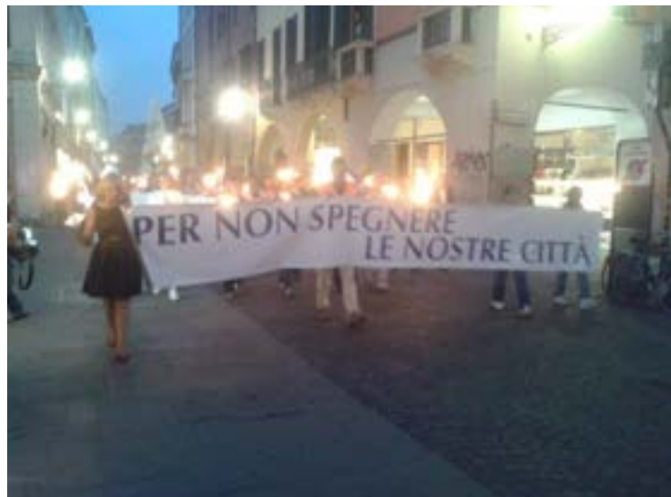
Figure 9 – Citizens protest against the closure of neighborhood shops