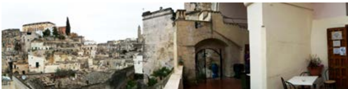
Figure 10 – The historical “Sassi” in Matera, a consolidated urban tissue