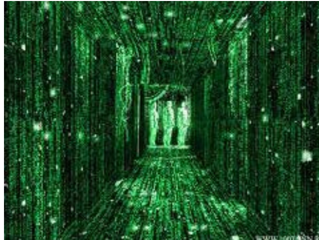
Figure 4 – The Digital Space of Matrix, L. & A. Wachowski, 1999