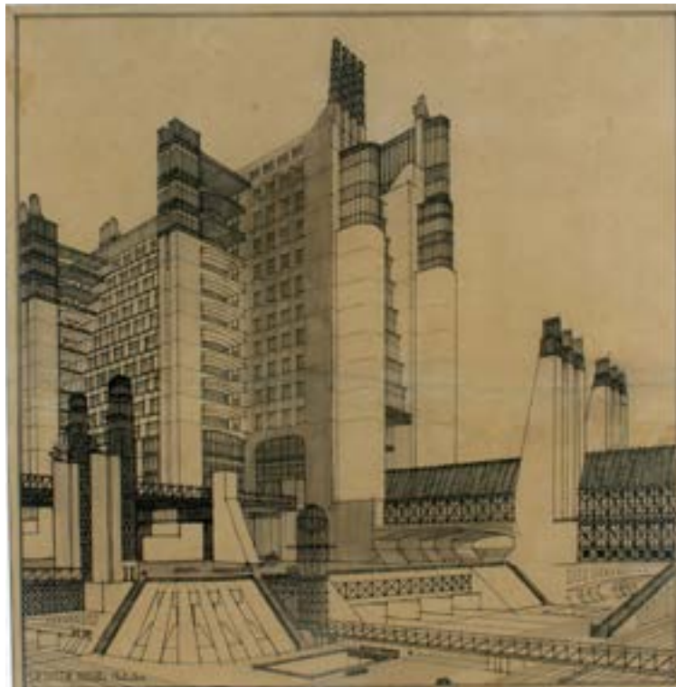
Figure 7 – Future city, Sant'Elia, 1914