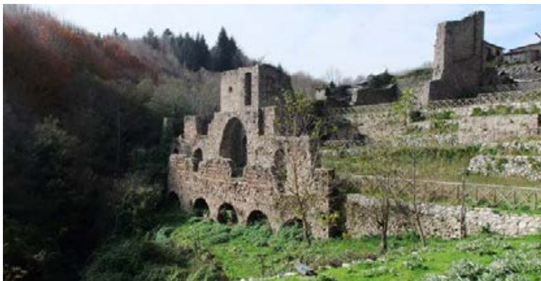
Figure 11 – Ruins of industrial plants in Mongiana (VV)