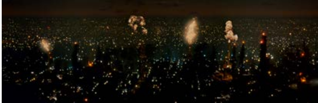
Figure 3 – The city in Blade Runner, R. Scott, 1982

- it left for decades - the economy the guide of all that and the result is the current globalization devastating both in social and spatial terms 5 .